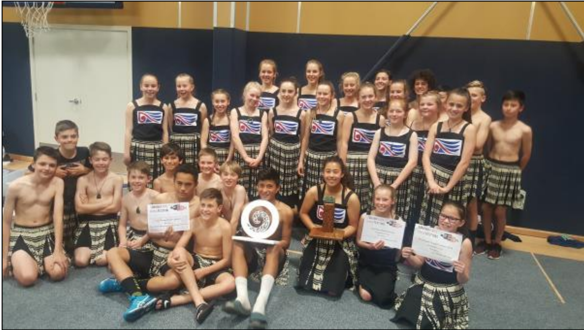
Te Rupo Hari Koa with their awards

Congratulations to Te Rupo Hari Koa, our kapa haka group. The group picked up three awards at the Tūhono Competition. They won the Year 7&8 waiata-ā-ringa (action song) award and shared the haka award with Breens Intermediate. To top it off they won the overall winner of the Year 7&8 section of the competition. Ka mau te wehi!